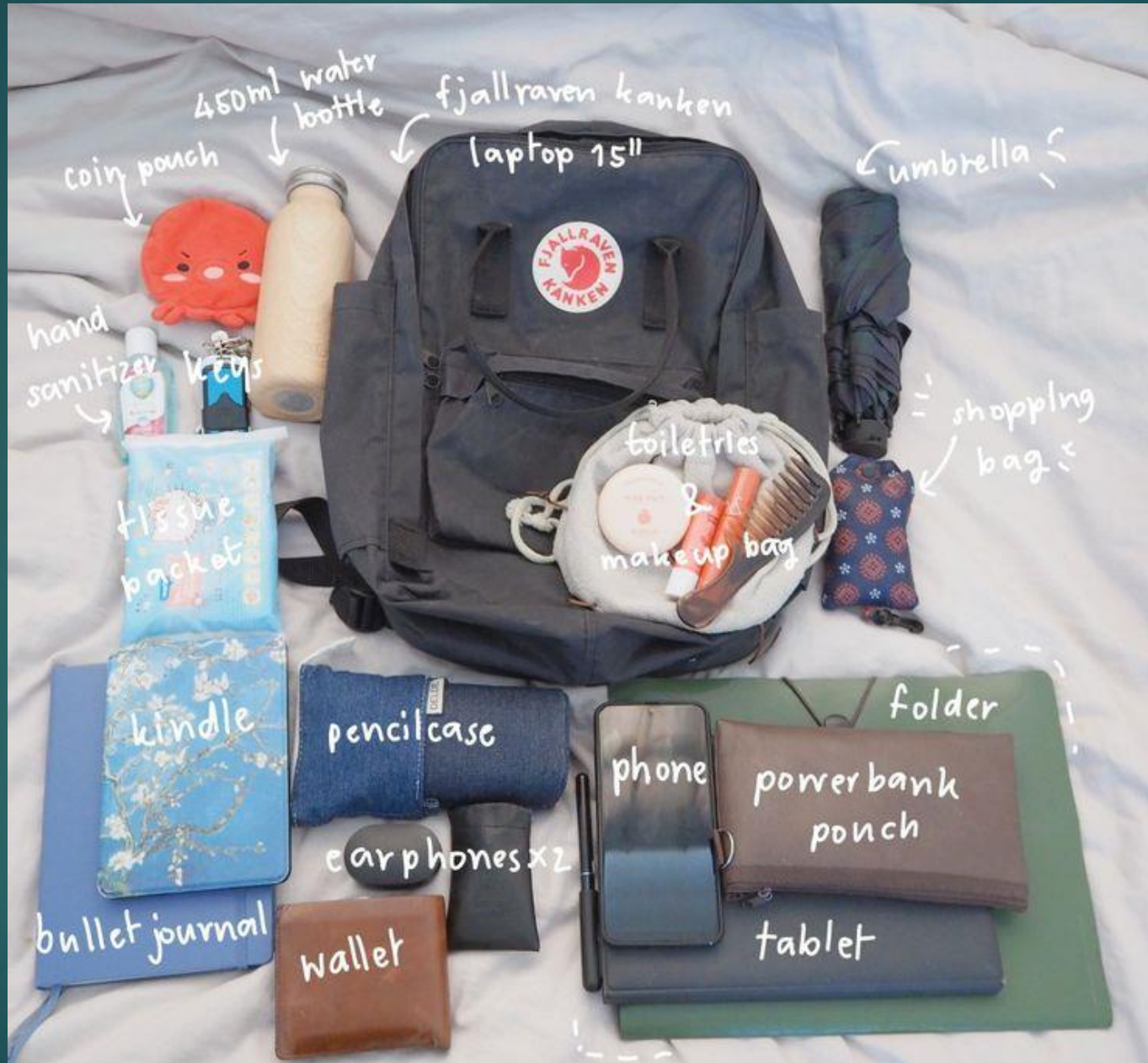
WHAT'S IN MY (UNI) BAG 2020!