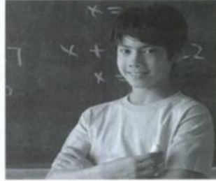
6 Stewart / Stuart