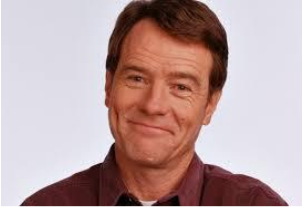
He is my dad.