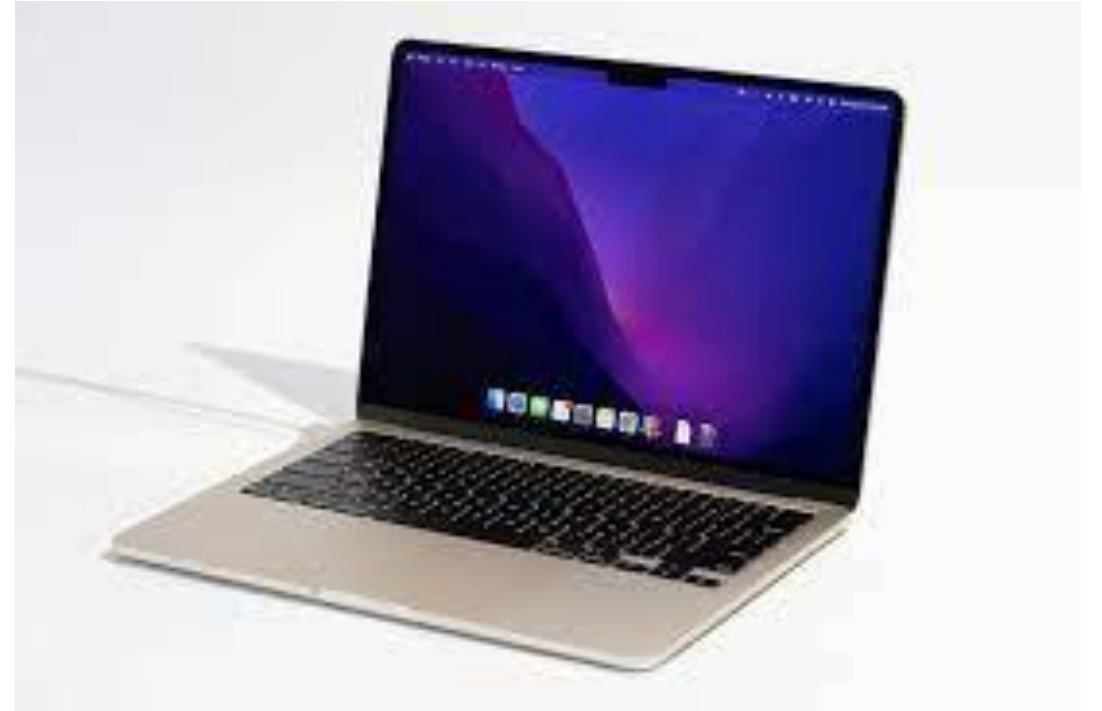
It is a laptop.