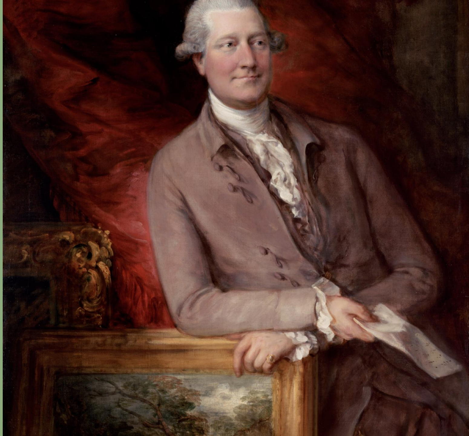
JAMES CHRISTIE (AUCTIONEER)