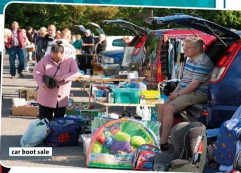
car boot sale